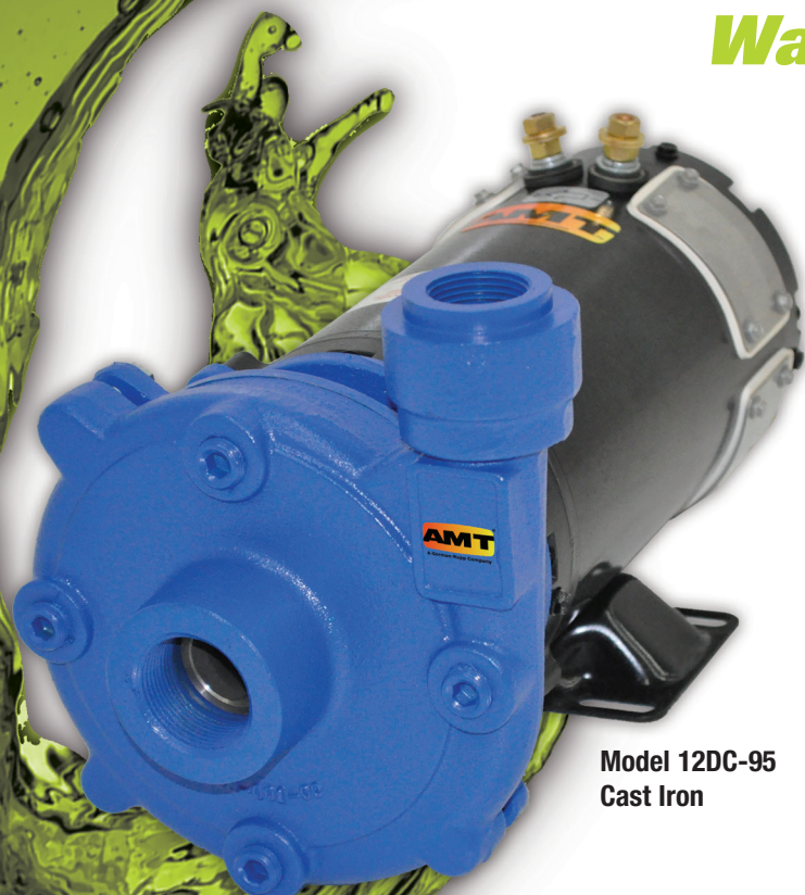
Model 12DC-95 Cast Iron