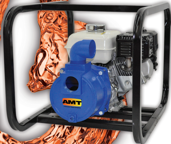
Model 316F-95 Dredging Pump