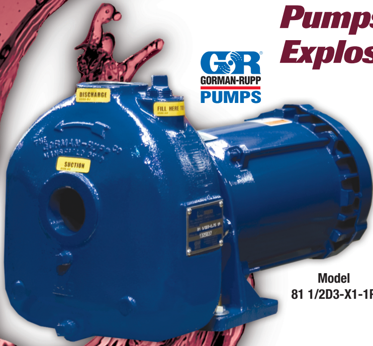
Model 81 1/2D3-X1-1P