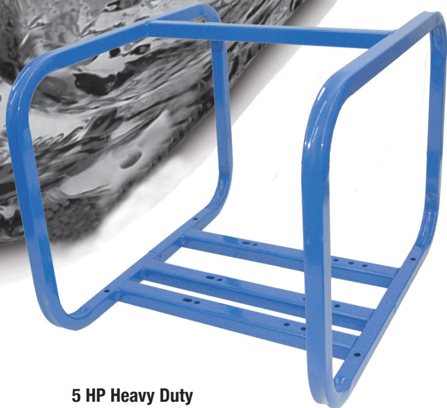
5 HP Heavy Duty Steel Roll Frame Assembly