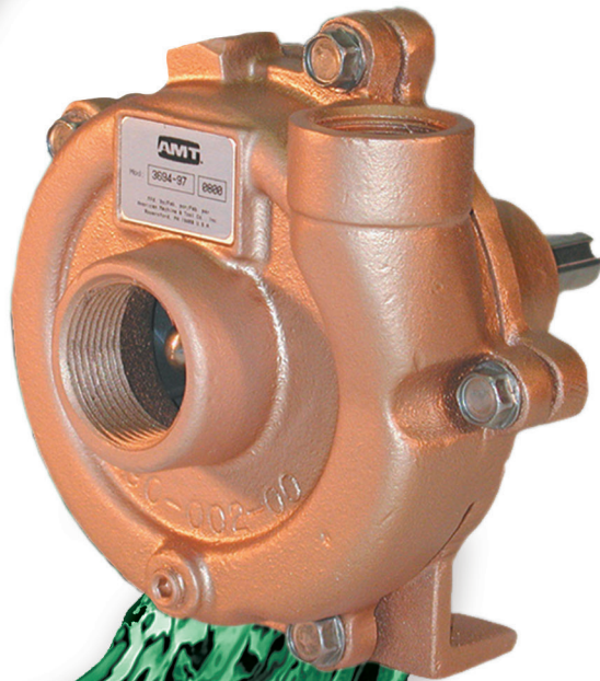
Bronze Straight Pedestal