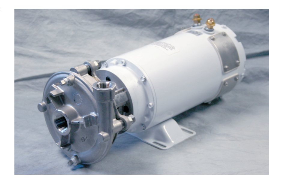
Diagram & Specs